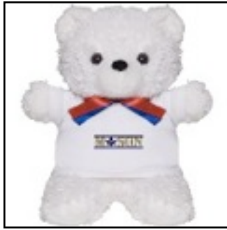
MASONIC TEDDY BEAR